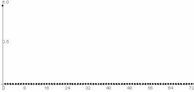
Fig. 1. Autocorrelation A(u, u) for CAZAC with K = 75 .